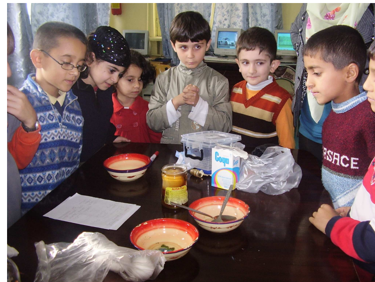
Years 4 and 5 prepare to cook something...

"Remember, remember the 5 th of November!" For non-British readers, on November 5 th every year the English celebrate Guy Fawkes' attempt to blow up the Houses of Parliament. GIS also had a pumpkin for Halloween and a special presentation for Thanksgiving.