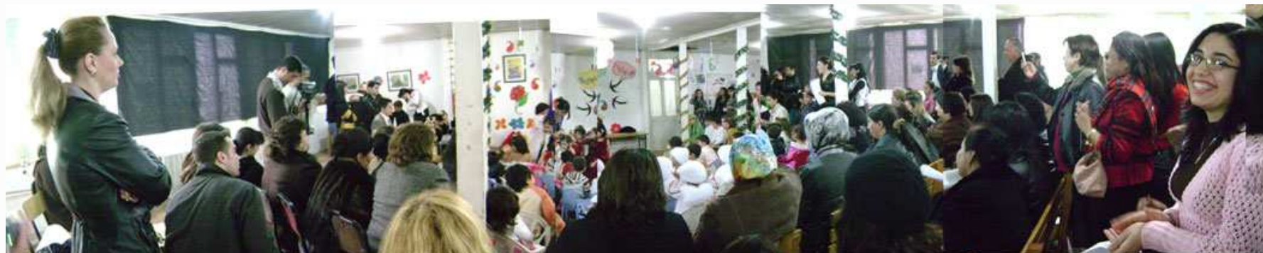
Below: parents watching performances at the Novrus concert.

Across: 1 British; 2 America; 3 Aida; 4 Nizami; 5 Russian; 6 Finland; 7 Write; 8 Veil; 9 Board; 10 Bylaws; 11 Gunay Down: 11 Ganja; 12 Yaver; 13 Ruzigari; 14 Shiley; 15 Summer-club; 16 Cy; 17 SEN; 18 D&T; 19 Norway; 20 AZED; 21 ICT; 22 License